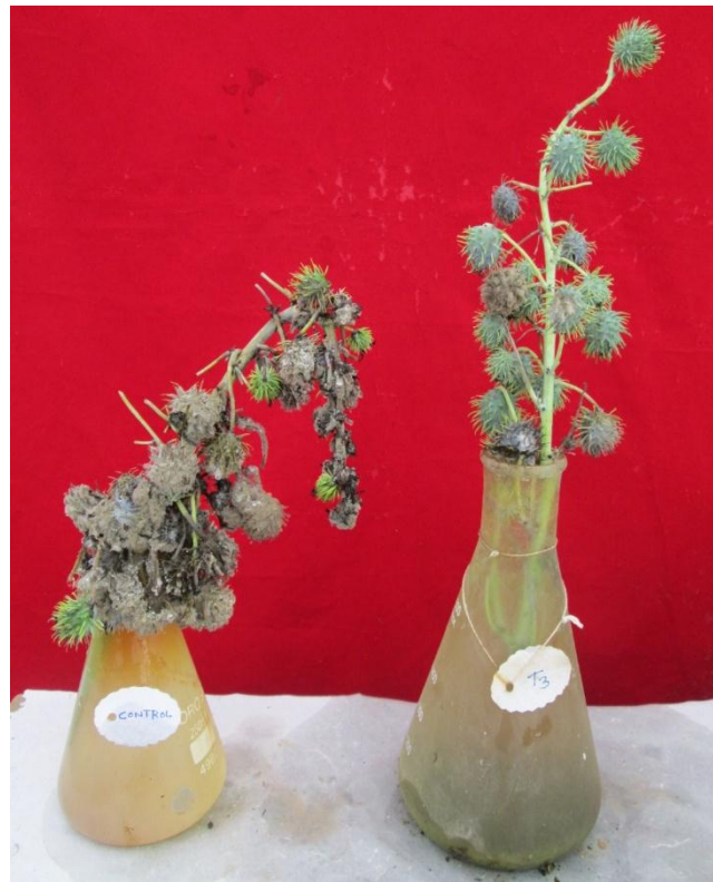
Plate 2: Effect of Trichoderma asperellum (Isolate 2) on castor gray mold disease under green house conditions