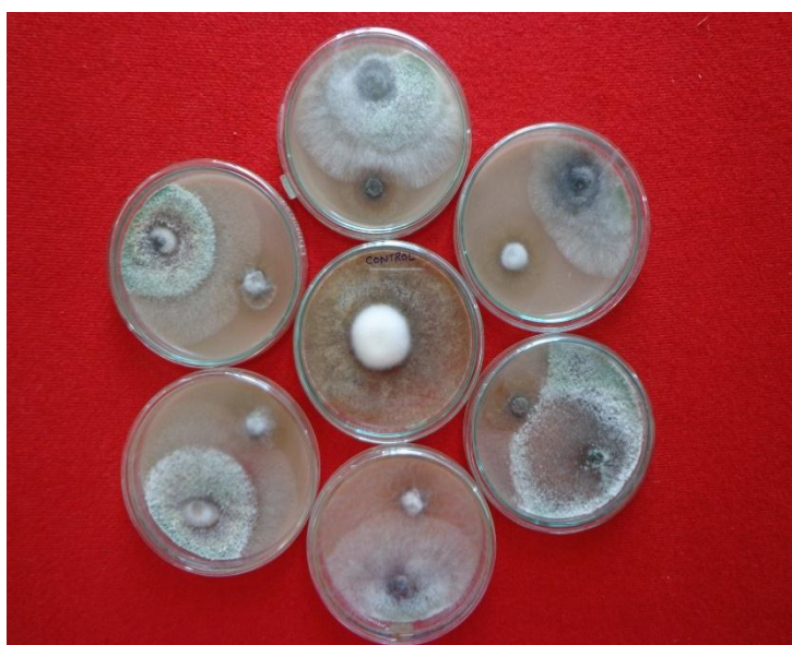
Plate 1: Antagonistic activity of Trichoderma spp. against Botryotinia ricini