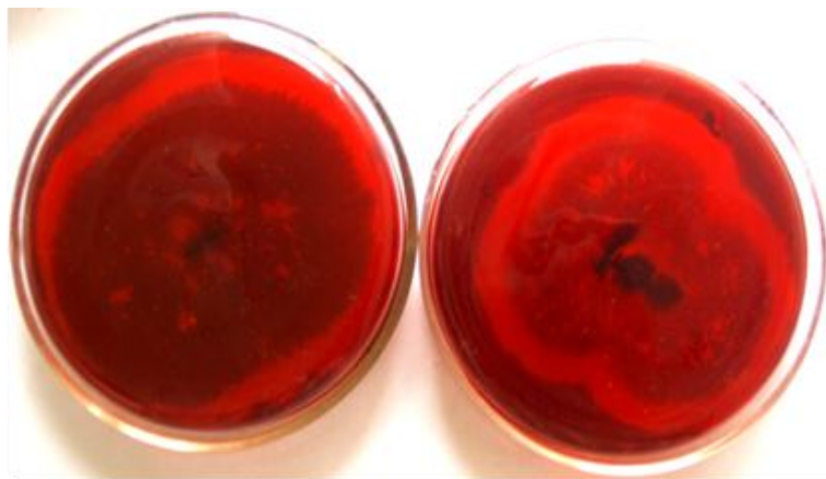
Plate 4: Glucanase activity of T. harzianum isolate 5 & T. asperellum isolate 3